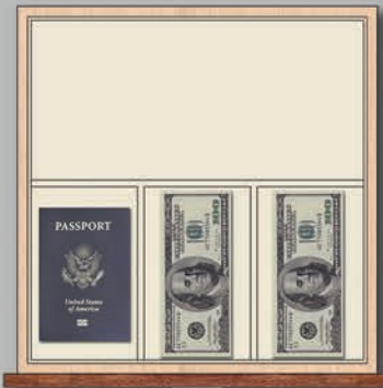
Layout M Currency Drawer

Compartments for Passport & Cash Storage Cost = $75