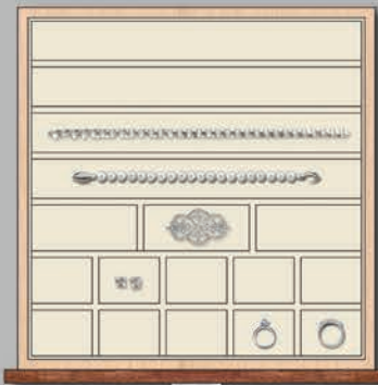
Layout Q Jewelry Drawer 2

Ten 2 1/4" x 1 3/4", Three 4" x 1 3/4" Compartments, & Horizontal Dividers Cost = $75