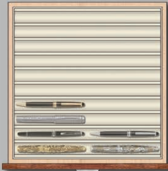
Layout K Pen Drawer

Flat Storage for Watches Five 2 1/4" x 12 3/4" Compartments Cost = $75