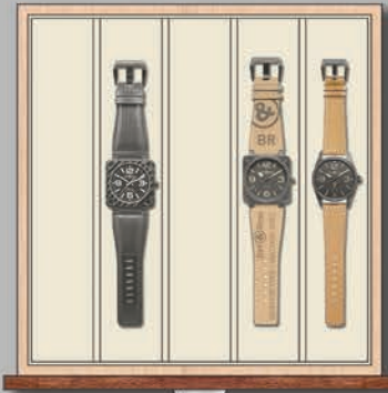
Layout J Flat Watch Drawer

Flat Storage for Watches Five 2 1/4" x 12 3/4" Compartments Cost = $75