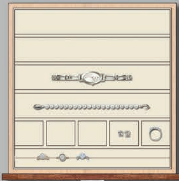
Layout P Jewelry Drawer 1

Grooved Jewelry Holder, 2 1/4" x 2" Compartments, & Horizontal Dividers Cost = $75