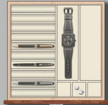
Layout L Man Drawer

Half Pen Storage and Half Storage for Watches & Jewelry Cost = $75