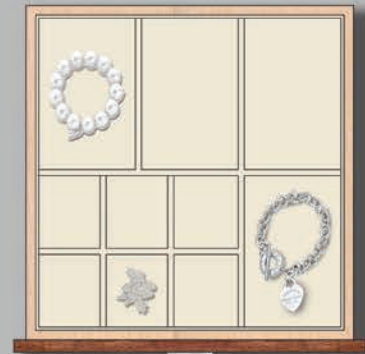
Layout R Jewelry Drawer 3

Six 2 1/2" x 3" & Four 4" x 6 1/4" Jewelry Compartments Cost = $75