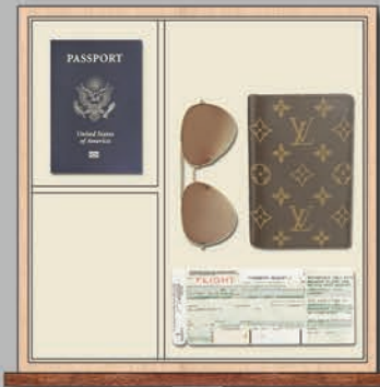
Layout N Travel Drawer

Compartments for Passports & Travel Documents Cost = $75